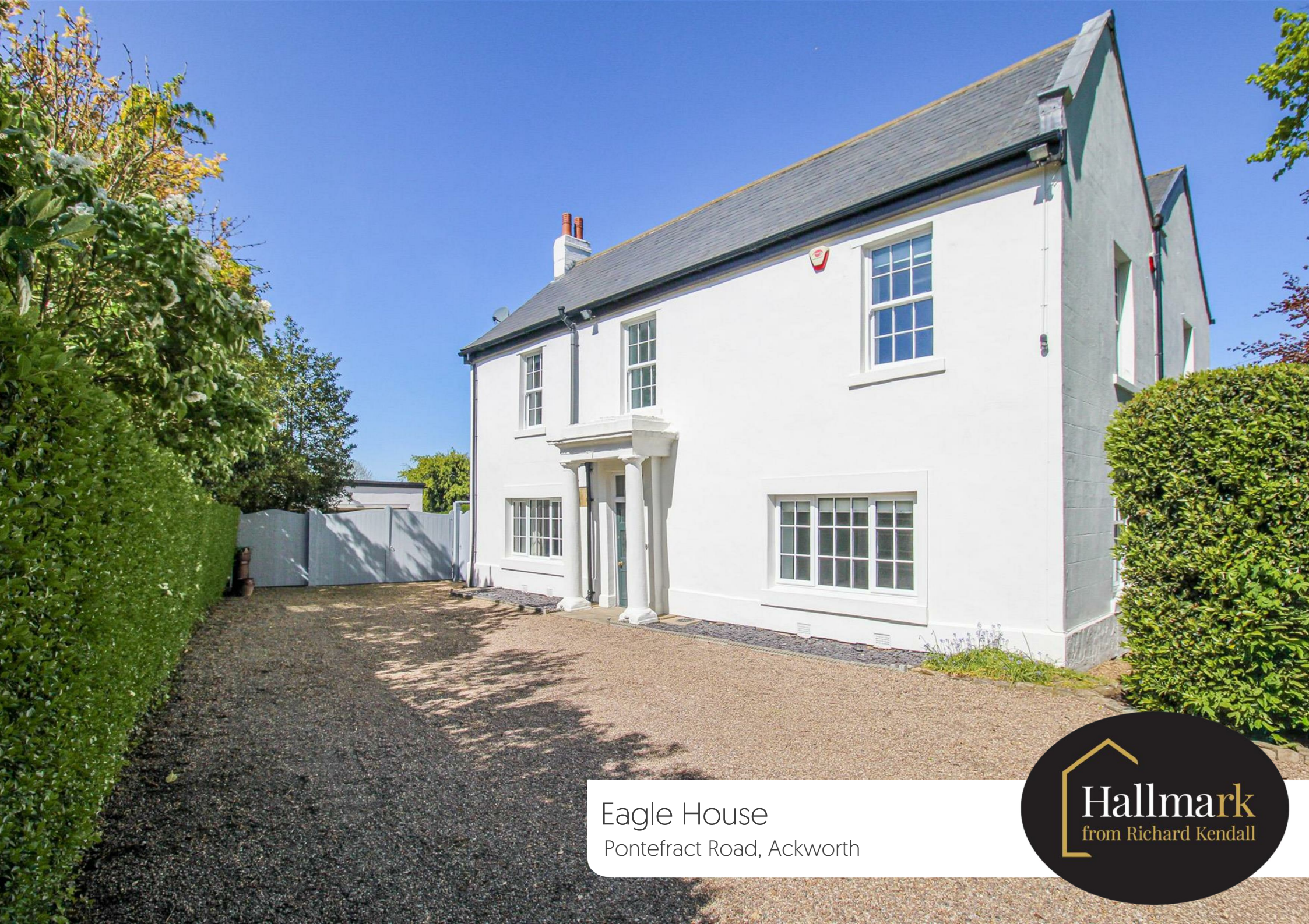
Eagle House Pontefract Road, Ackworth